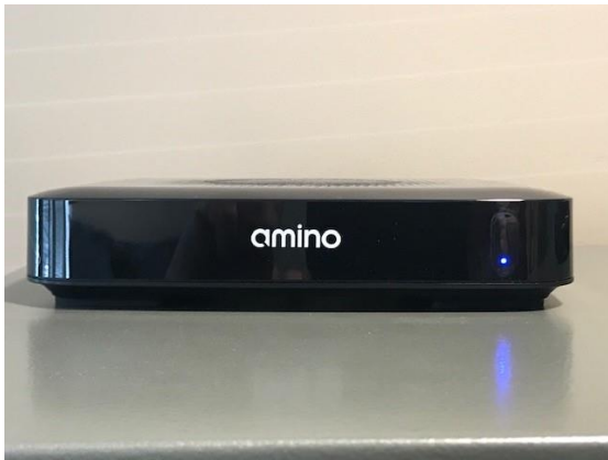
HD Cable Box (Power On- Blue Light)

TIP 1: MAKE SURE YOUR BOX IS POWERED ON (LOOK FOR A BLUE LIGHT)