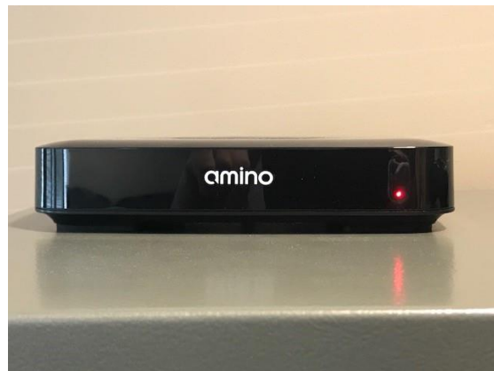
HD Cable Box (Power Off - Red Light)