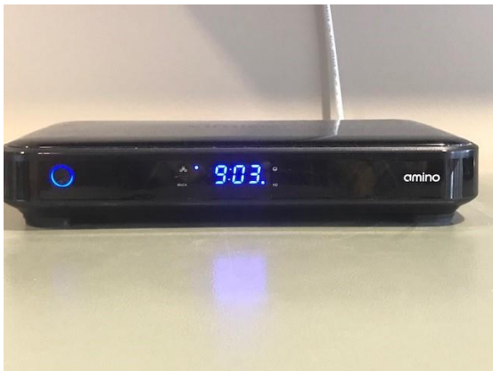
DVR Cable Box (Power On - Blue Light)