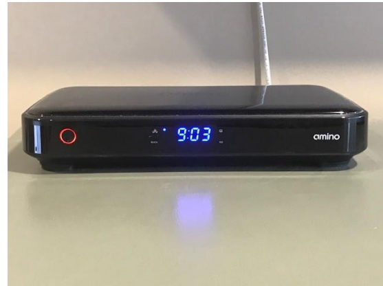
DVR Cable Box (Power Off - Red Light)

When using the new IPTV set top boxes the first thing you'll want to do is to make sure that the Cable Box is Turned/Powered On. The new Amino boxes have an easy indication light on the front to help figure out if the box is ON or OFF.